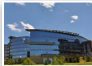
Trinity River Campus