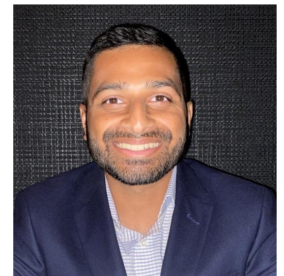
Clinical Coordinator/ Faculty Instructor