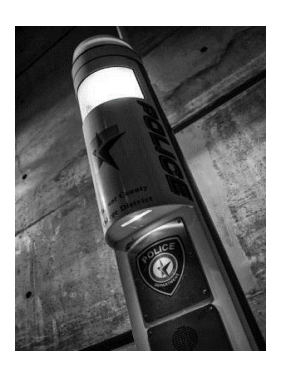
Make a call, make a difference. The Tarrant County College Police Department cannot fight crime if it is not reported.

Dispatchers are available at the Tarrant County College Police Department telephone number 24 hours a day to answer your calls. In response to a call regarding a reported crime, Tarrant County College Police Department will take the required action, either dispatching an officer or asking the victim to report to Tarrant County College Police Department to file an incident report. Information gathered by the investigating officer will be compiled into a police report that is entered into the Department's records management system. In response to a reported emergency, Tarrant County College Police Department will respond and summon the appropriate resources to assist in the response to the incident. Tarrant County College Police Department reports are forwarded upon request to the directors of student conduct on each campus for review and referral for potential action, as appropriate. Tarrant County College Police Department investigators will investigate a report when it is deemed appropriate. If assistance is required from the local police agencies or the fire department, Tarrant County College Police Department will contact the appropriate unit.