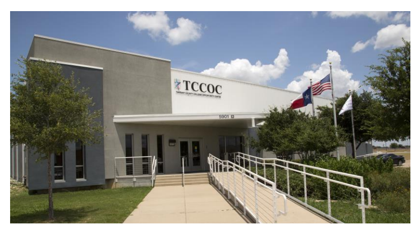
Tarrant County College Opportunity Center

There are no On-Campus student housing facilities associated with this campus.