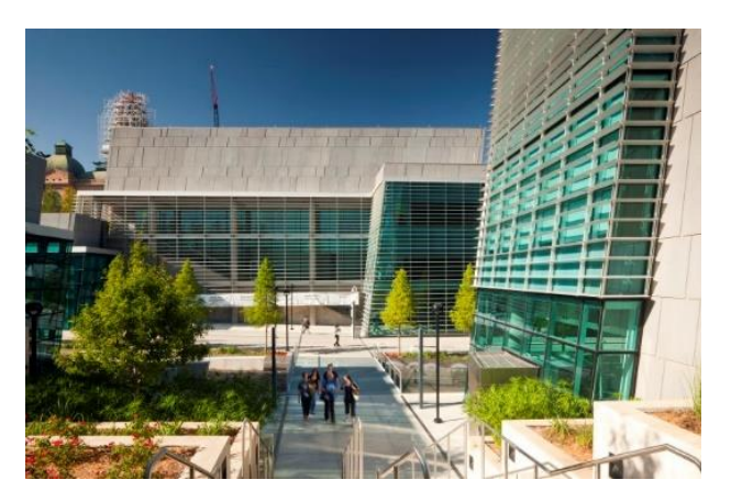
Trinity River East Campus